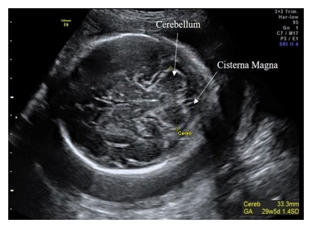
Fig. 2 Example of the TCD measurement in a 27-week plus 6-day old female fetus. For TCD measurements, the transducer was slightly rotated from the thalamic plane (used to measure HC) until the posterior fossa was visible. TCD was measured using the 'outer-to-outer' method. TCD taken during the research scan always showed LGA. This is due to the fact that the internal growth charts on the GE Voluson 8 Expert ultrasound scanner [60] did not cover this GA. However, all TCD were within expected 5–95 centile ranges