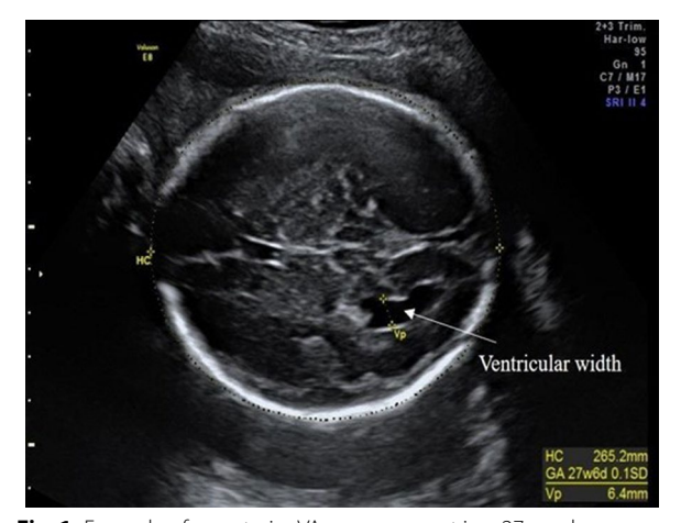
Fig. 1 Example of a posterior VA measurement in a 27-week plus 6-day old female fetus. VA was measured slightly above the level of the thalami in the axial plane of the fetal brain. Electronic callipers were placed perpendicular to the long axis of the ventricle (highlighted by the yellow dotted line)